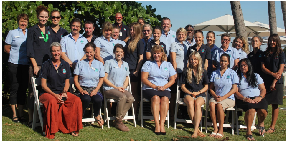
The Boab Health Services team at the All Staff Planning Day in May.