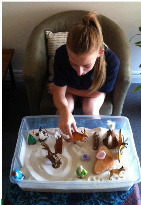
Sand therapy is one style of therapy offered from our Broome office.